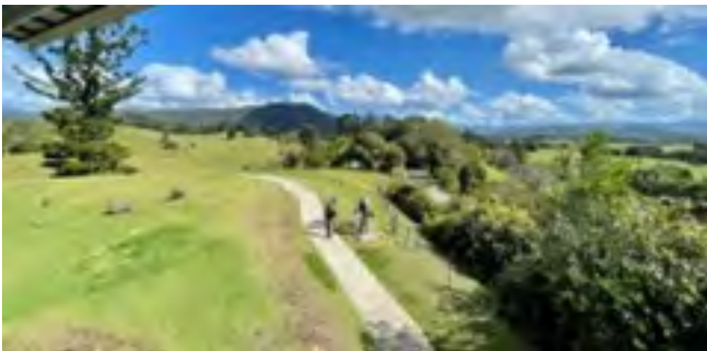
Outlook from Margaret Olley's House

The scenery on the north coast was a sight for sore eyes with the deep green pastures and the flowing rivers and full dams. Margaret Olley and her family had lived in the area in her childhood, which is the reason for the Gallery site.