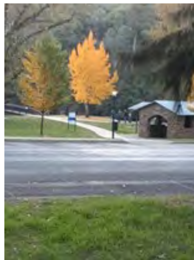
Autumn Leaves in Bright

The accommodation in Bright was enhanced by the roaring wood fire and scrumptious meals for dinner and breakfast. Bright lived up to expectations with an array of beautiful coloured autumn leaves. The previous week there had been a dumping of snow on Mt Buffalo and Mt Hotham and much of it remained on the mountain tops.