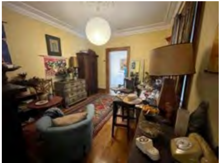
Margaret Olley House

The Margaret Olley Art Gallery was wonderful, and enjoyed to the max. by all the visitors. As this is the 100 th year since her birth there were special activities in place for our enjoyment and for children.