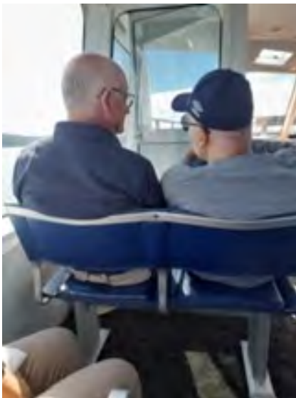
What could these two gents be plotting!!