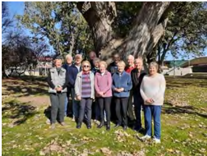
The Phoenix Tree in Myrtleford

The coach was comfortable with good heating which made it possible to enjoy the crisp air at our various stops. We travelled along a number of country roads which enabled us to drive beside Lake Hume and stop beside the Phoenix Tree in Myrtleford with its incredible root system. None of us were tempted to go swimming when we reached Wagga Wagga don't know why???