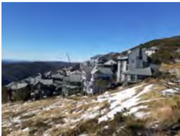
Mt Buffalo Chalet

We had perfect weather for the entire trip which enabled us to enjoy a luxury picnic lunch on the lawns of the Mt Buffalo Chalet.