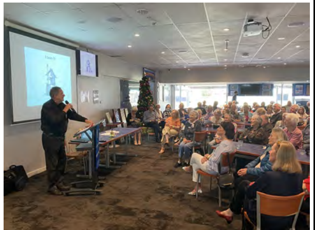
Members “glued” to their seats so to speak