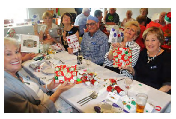
Trivia Quiz Winners

See the our website for more Photos - www.huntershillprobus.org