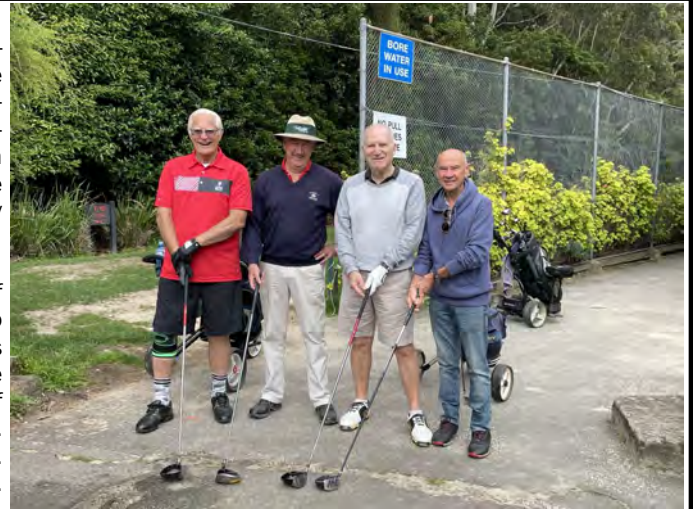
Four, would be if they could be, golfers desperately seeking Sponsorship and a fashion stylist, not to mention lessons

Of the five intrepid members, four turned up at the Royal Lane Cove International Golf, Recreation and Leisure Centre on Monday 9 th November to take on the challenges of this particularly arduous and tricky course.