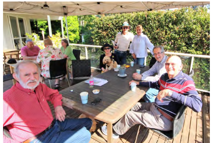
Coffee morning Huntley's Cove - September