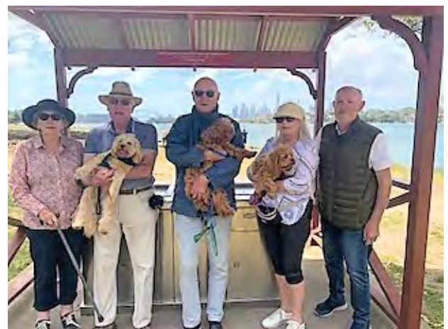
Dog Walking - October