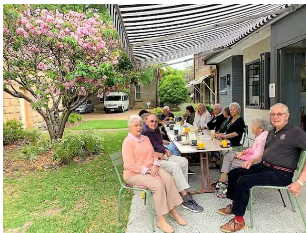
Coffee morning Sun Room - October