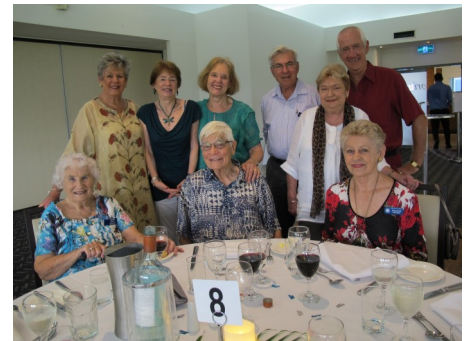
A powerful group, current and previous Presidents