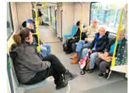
The rest looked on in awe while the staff member ignored the whole thing having seen it all before