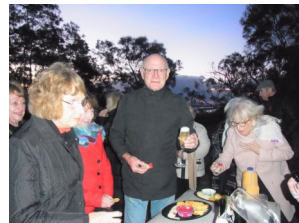
Nibbles at dusk