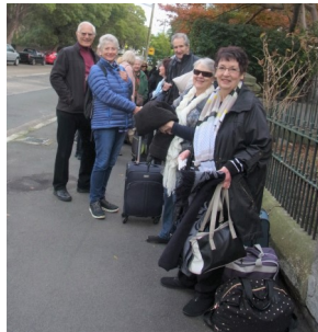
Rugged up and ready to go