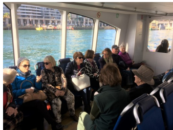
Enjoying the trip