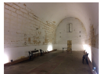
Inside the Gunpowder Magazine