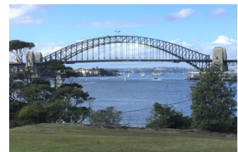
and the view