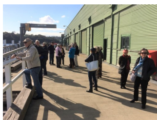
Time to leave