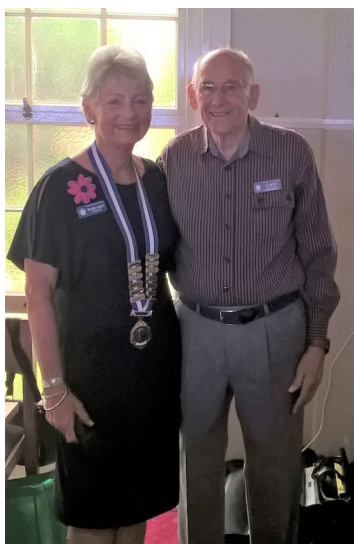
Your New President